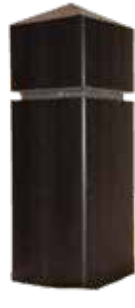
Peak & Route