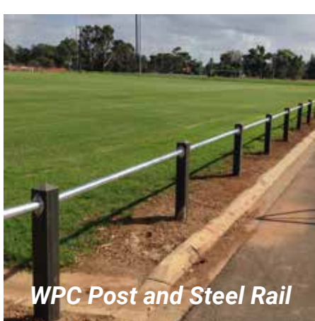
WPC Post and Steel Rail