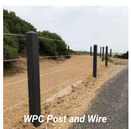
WPC Post and Wire