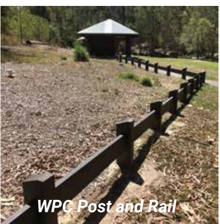
WPC Post and Rail